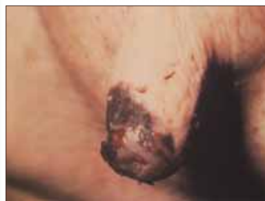
Ruptured teat lesion with necrosis.