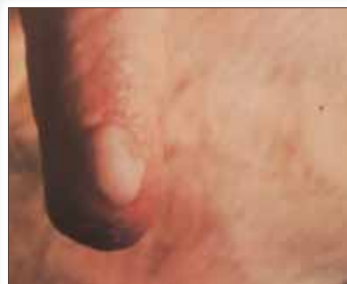
Unruptured teat lesion on a cow.