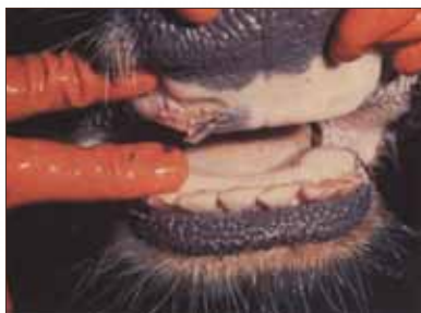
Ruptured vesicle on the dental pad.