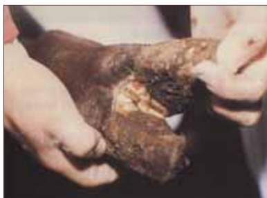
A ruptured vesicle with blanching of tissue in the interdigital space.