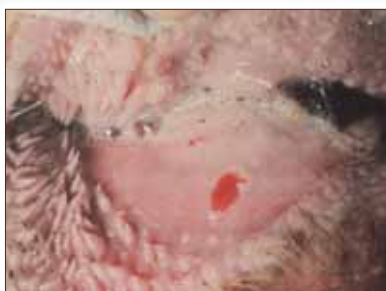
Ruptured vesicle producing erosive lesion of the gum.