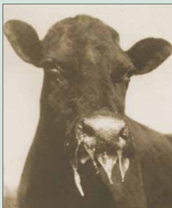
Excessive salivation and smacking of the lips are early signs of FMD.

Foot-and-mouth disease (FMD) is a severe, highly communicable viral disease of cattle and swine. It also affects sheep, goats, deer, and other ruminants (cloven-hoofed, cud-chewing quadrupeds). FMD is not a threat to human health.