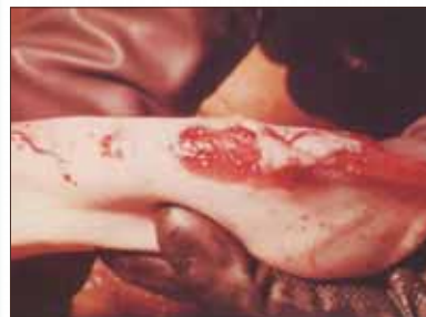
Tongue vesicles that have ruptured and begun to slough.